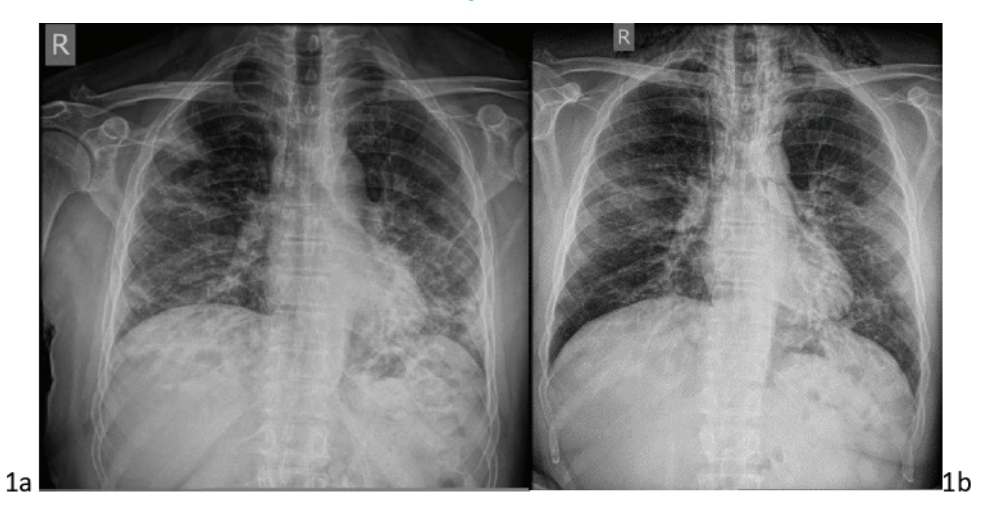
Figure 1. a) PA chest x-ray on admission with COVID-19 widespread pulmonary infiltrates bilaterally. b) Subcutaneous emphysema (vertical lucent stripes into the neck) and "double bronchial wall sign" suggesting pneumomediastinum. Small line of air parallel to trachea and the left cardiac border

Venturi mask of FiO2 0.4, and initiated empirical double intravenous antibiotic therapy with piperacillin/tazobactam and vancomycin to prevent presumed mediastinitis. This antimicrobial treatment was based on the fact that he was already on the sixth day of hospitalization, as well as on the most up-to-date data for COVID-19 coinfections<sup>3</sup>. Therefore, Pseudomonas aeruginosa <sup>4</sup> and Methicillin-resistant Staphylococcus aureus ( MRSA )<sup>5</sup> had to be covered, while the results from the blood cultures were still pending.